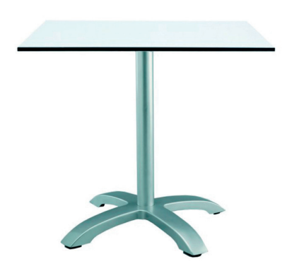
Table for indoor and outdoor with cast aluminium base. Shiny or matt painted finish. Anodized aluminium tube, \emptyset 60 x 2 mm thick. Non-turn notch. Steel counterweight 4.5 kg (9.90 lb). With regulators in all 4 legs. Table top in high pressure laminate (HPL).