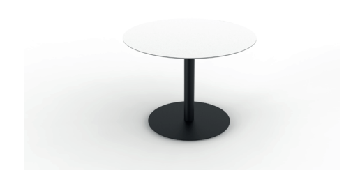
Table for indoor use with painted cast iron pedestal base table. \varnothing 80 mm tube. Non-turn notch. Base dimensions: \varnothing 66 cm. Table top in high pressure laminate (HPL).